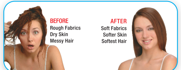
Makes your hair soft & skin glow